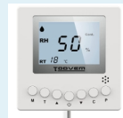
Remote Control (Optional)