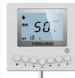
Remote Control (Optional)